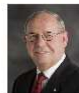
Meet the President