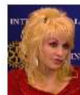
Dolly Parton & Rotary